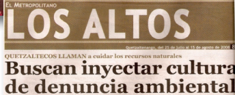
Print ad: "Let us choose our future" (Top) Newspaper headline: Promoting public reporting of environmental crimes (Bottom)