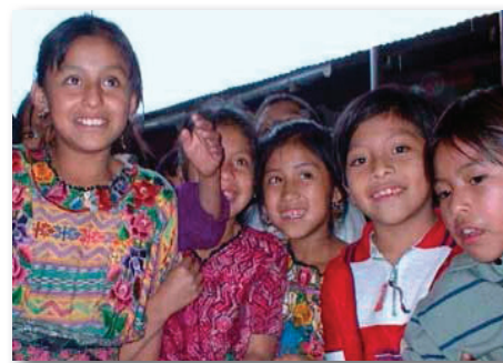
Local children learn how to protect their environment

Helvetas worked closely with local schools and community organizations to promote the sustainability of the message and the use of the reporting mechanisms. Several community development organizations signed letters of commitment offering to continue to support the program's goals. Teachers who took part in the campaign were highly enthusiastic because they could use the pamphlets and flyers in their own environmental curricula to encourage children to enhance their futures by protecting their environment.