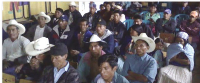
Community meeting in Quetzaltenango

The program used various local and mass media outlets to convey informational and promotional messages, including featured stories and advertisements in newspaper and radio. In an effort to connect broadly with the population of the Western Highlands, Helvetas delivered radio advertisements in Spanish and two indigenous Mayan languages (Kiché and Man). The public campaign consisted of 640 radio announcements, 15,000 flyers and pamphlets, 1,000 posters, 20 banners, and 9 newspaper advertisements in the regional press. Following this campaign, MARN reported an increase in the number of calls to its toll-free hotline, and that during the first half of 2009 the number of calls averaged 55 per month.