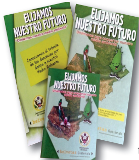
Promoting public awareness with flyers, pamphlets & posters

Helvetas, a Non-Governmental Organization (NGO) in Guatemala, is working in collaboration with Guatemala's Ministry of Environment and Natural Resources (MARN) to assure widespread public awareness of, and access to, the ministry's toll-free phone line of alleged violations of environmental protection laws. The U.S. Department of State Bureau of Oceans, Environment and Science (OES) support this