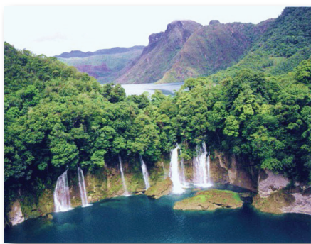
Laguna Brava, Huehuetenango

This program is part of a broader initiative that OES and the Department's Regional Environmental Hub at the U.S. Embassy in San Jose are spearheading throughout the CAFTA-DR region to educate civil society about CAFTA-DR public participation mechanisms and to encourage people to work with their governments to ensure effective enforcement of environmental laws.